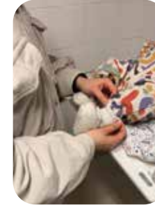
PARENTS AND BABIES' CORNER