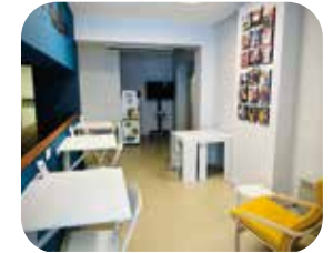
RECEPTION DESK INFORMATION COWORKING SPACE

FIND ALL THE STORES AND CAFÉS/RESTAURANTS OF THE CITY CENTRE HERE